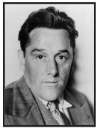
WILLI MUNZENBERG, JEWISH REVOLUTIONARY OF THE FRANKFURT SCHOOL

Willi Münzenberg summed up the Frankfurt School’s long-term operation thus: “We will make the West so corrupt that it stinks.”